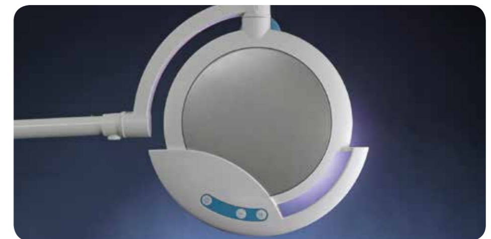
Brightness control via grip and control panel with indicator bars